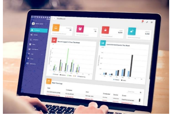
Enterprise Hub provides an easy way to administer security policies for all computers and users on the network, while detailed access logs verify authenticity of users logging onto a company's network, locally or remotely.

Each user is provided with a GateKeeper Halberd or Smart Badge, or with the Trident App, users can use their smart phone as a wireless key. Wireless keys (tokens) are registered for each person on the server and serve as a unique identifier for that individual. The token will be detected and used for authentication when the individual logs into their computer.